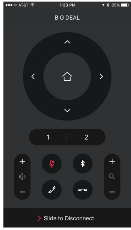
Soft Remote User Interface

We tested the discovery / pair functionality and confirmed that the soft remote worked just as well as the RF remote (all commands worked as expected with very low delay).