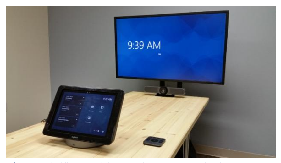
Skype for Business huddle room including Logitech MeetUp connected to Skype Room System (Surface Pro 4 tablet installed in a Logitech SmartDock)

Full Duplex Support – MeetUp passed our full duplex audio test (near and far-end participants speaking and hearing each other at the same time) without issue.