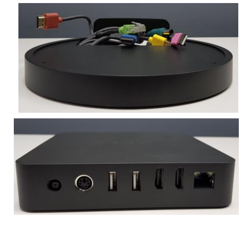
Figure 1: SmartDock (Left), SmartDock Flex Base (Top Right), and SmartDock Flex Extender Box (Bottom Right)

The SmartDock / Skype Room System combination can be used with any Windows-compatible USB audio and video accessories, but many customers will use one of Logitech's conferencing solutions like Logitech GROUP, Logitech MeetUp (see evaluation report), or the soon-to-be-available Logitech Rally.